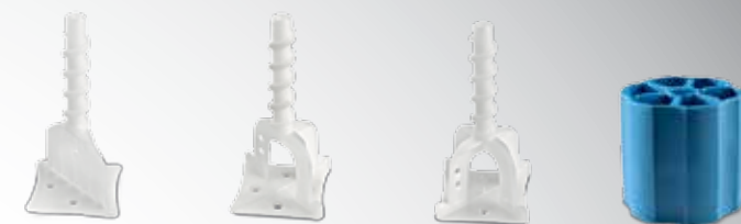
PRSL 1 PRSL 2 PRSL 3 PRSL 5