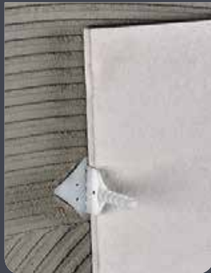
Linear leveler installation.