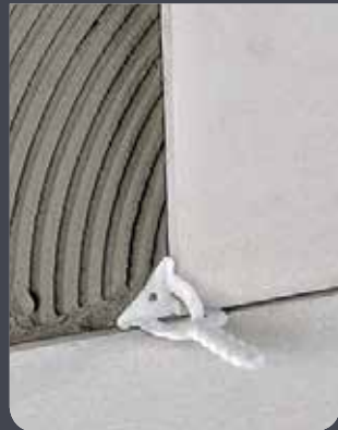
T-shaped leveler installation.