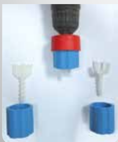
Remover: fixed on a drill allows to remove levelers from caps (Anticlockwise)