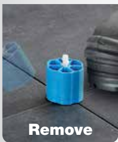
Kicking the clip in the direction of the joint.